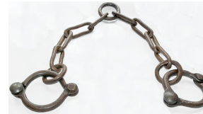
Leg-irons truncheon and handcuffs